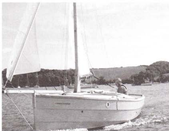
Racing to Trethem